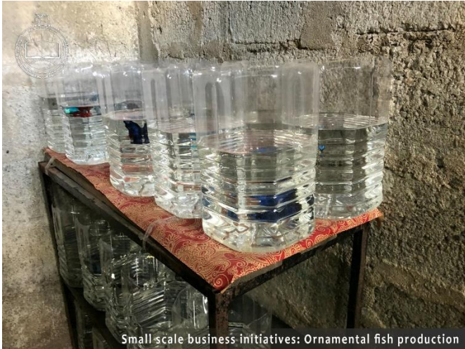
Small scale business initiatives: Ornamental fish production