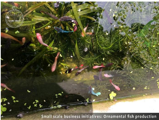
Small scale business initiatives: Ornamental fish production